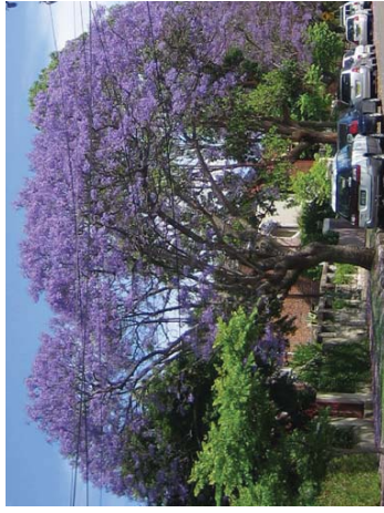
Jacaranda mimosifolia Mature Height: 10-15m