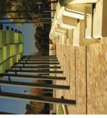
Articulated seating wall