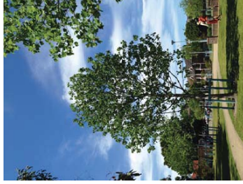
Liriodendron tulipifera Mature Height: 15-20m