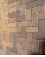
CoS or recycled brick paving